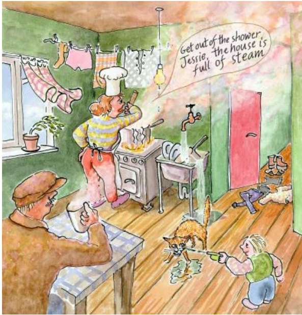
Figure 1.4 Humans, from the point of view of building physics, are merely sources of water.

Humidity control in storerooms is a little more complicated than in showcases or packages because the ventilation rate is enough to stress the ability of absorbent materials to absorb and release water vapour fast enough to compensate for the air change. The ventilation rate in store rooms can be low, because there are no people permanently resident in the room, but it is desirable to maintain a slight over-pressure within the room to stop dust and pollutants from entering. The possibilities for low energy control are summarised in chapter 6.