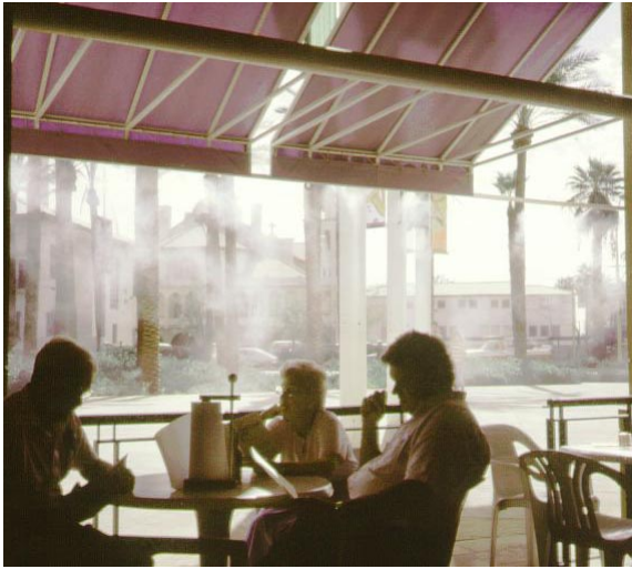
Figure 1.1 A cafe scene in Phoenix, Arizona. The air is cooled by evaporation of water sprayed from the edge of the canopy. The air becomes more humid but the customers are more concerned with keeping cool.

This thesis is about controlling the relative humidity inside buildings by using the water absorption properties of porous materials.