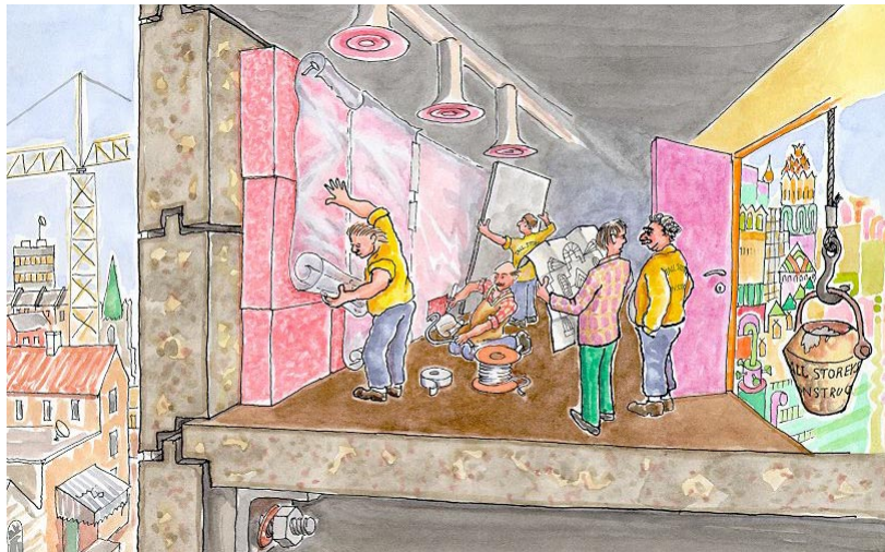
Figure 1.5 In modern buildings an impermeable barrier is often placed just behind the interior finish.

Condensation damage is, however, not unknown in modern buildings with vapour barriers and more or less non-absorbent materials in the walls (10). The reason for this is that any hole in the barrier will allow air to flow into parts of the wall which have no ability to delay condensation by absorbing water vapour. After condensation has