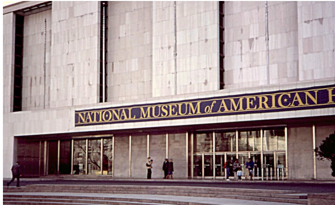
Figure 1.6 The National Museum of American History, in Washington D.C. On a bright spring morning the marble facade is stained by meltwater from ice that has condensed from the inside air.

20°C. Nevertheless, museums in old buildings, typically of massive brick construction, seem to survive whereas some purpose built museums with complicated precautions